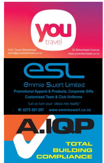
ASBESTOS MANAGEMENT PLANS